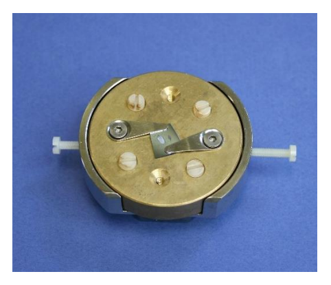
Figure 2: Polymer screws isolate cryo-stub from holder

Cryo-SEM imaging is a powerful tool in studying the structures of electron beam and vacuum sensitive materials. These materials include: fragile biological structures such as fungi, plants, cells, etc. as well as soft or volatile samples and even liquids. Cryo-SEM offers some clear advantages by rapidly freezing a sample prior to imaging, thus maintaining the sample as close as possible to its natural state. Long dehydration and chemical fixation steps can be avoided. Inhibiting dehydration helps maintain delicate structures without shrinkage. Moreover, volatile or even liquid samples are stabilized under the electron beam. Cryo fracturing techniques allow for study of the internal microstructure of these types of vulnerable materials as well. A few of the disadvantages are that for efficient freezing, the sample size must be small and the price may not be in everyone's budget for a state-of-the-art cryo system with freezing station, cold stage, vacuum transfer system etc.