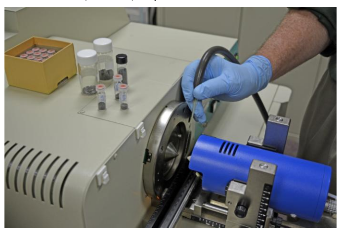
Figure 2. AccuTOF-DART analysis of a smokeless powder particle.

The AccuTOF<sup>™</sup> mass spectrometer was operated in positive-ion mode. Polyethylene glycol (PEG-600) was measured as a reference standard within each data file, but separate from the smokeless powder particle measurements. Individual particles sampled with vacuum tweezers were positioned in the DART gas stream for analysis (Figure 2). Disposable vacuum tweezers were constructed by passing a glass capillary through an Eppendorf pipette tip and inserting the pipette tip into a rubber hose connected to a low-vacuum pump. Data were acquired by using JEOL Mass Center software and mass spectra were processed by TSSPro3 software (Shrader Software Solutions, Detroit, MI).